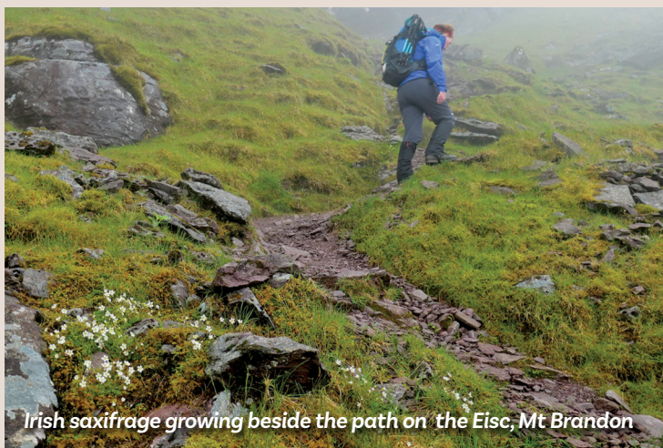
Irish saxifrage growing beside the path on the Eisc, Mt Brandon

population of the rare and beautiful Irish saxifrage ( Saxifraga rosacea ), more noticeable over the summer when it is in flower.