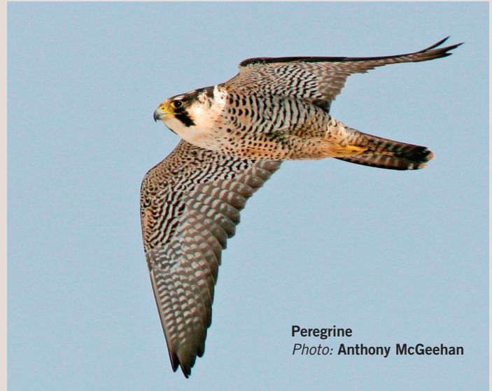
Peregrine

Peregrines prey on smaller birds such as duck or pigeon, and have at times been subject to persecution. National Parks and Wildlife Service Conservation Rangers, who have responsibility for wildlife protection in the Republic of Ireland, have acknowledged the role that climbers play in protecting peregrines and other cliff-nesting birds. This support is greatly appreciated as the service is currently under-staffed.