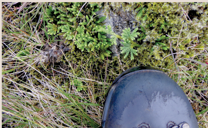
Alpine Clubmoss on Corrigasleggaun above Kelly's Lough in the Wicklow Mountains. Other locations in Wicklow where this species is vulnerable to trampling, particularly if groups spread out, include just north of the summit of Tonelagee and north of Mullaghcleevaun East Top.