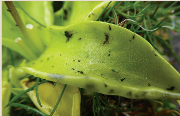
The sticky leaves of the greater butterwort plant are very effective at trapping insects, which the plant breaks down over a few days to compensate for the lack of nutrients in the damp, acidic areas where it grows.