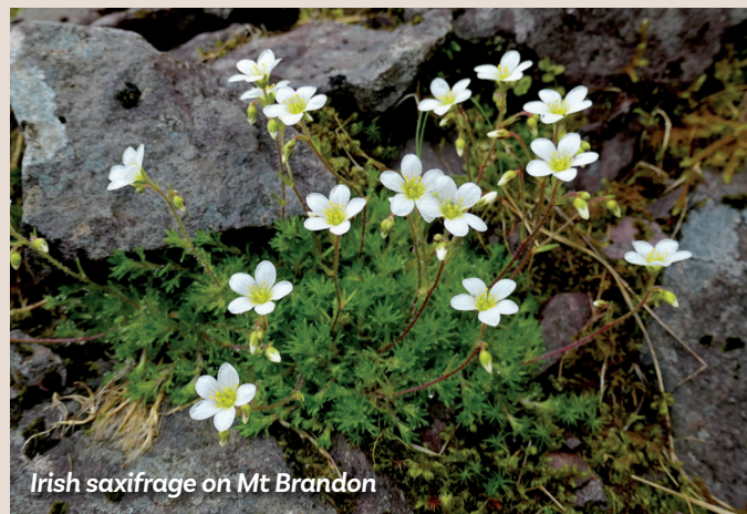
Irish saxifrage on Mt Brandon

An example is the Eisc on Mount Brandon, which holds an important