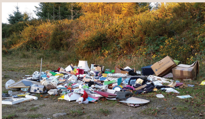
Fly-tipping in the Wicklow Mountains.