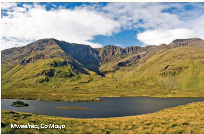
Mweelrea, Co Mayo