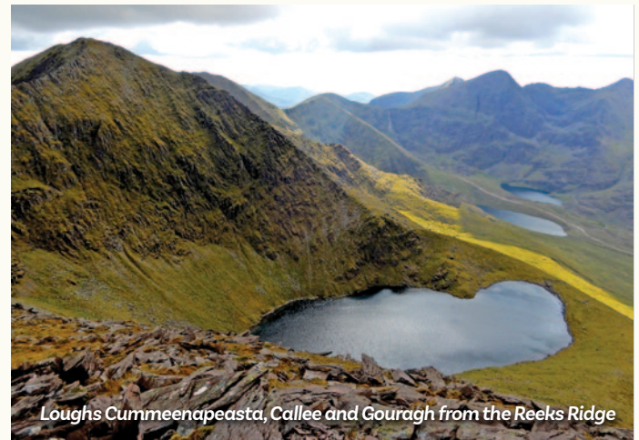
Loughs Cummeenapeasta, Callee and Gouragh from the Reeks Ridge

On the route to Masatiompan in the Brandon range, one passes over Sauce Creek, some 300 precipitous metres below. We are informed that people lived down on the shore up to the early 20 th century. It is worth the trip there alone to witness and contemplate such a location for human habitation.