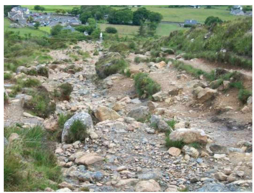
Section 1 – Looking northwards down the path to the start – braiding and turf "islands" very apparent, as is lack of any drainage. During heavy rain this would resemble a stream.

Then path departs the made up highway by a series of formally constructed steps which lead to the statue. From here the path continues beside a stream for some 500 metres to the mountain fence. The path is naturally constrained between the stream and a high bank and is at a gradual angle of approximately 15<sup>0</sup>. The soil is mainly glacial boulder clay with brown mineral soils at this point. It varies in width from about two metres up to five metres with a soil loss in places in excess of 1.5 metres. There are several braided paths with isolated "pockets" or "islands" of turf. The braiding is deeply gullied in places and appears to be worsening. There is no formal drainage and water damage and water flow along the gullied braids is very evident. The path surface is generally made up of loose and unconsolidated stones, often wet with surface water and in places very worn and uneven base rock is exposed making for a very uncomfortable walking surface which walkers try to avoid, exacerbating the problem.