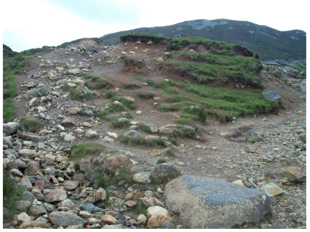
The large "turf island" halfway along Section 2 before the path levels out.

The path then crosses a more level area, widening as the angle eases. The depth of erosion and soil loss here is less severe than the lower sections, however this is offset by the width of the path at this point, as the terrain and gradient allows walkers to spread out. The path is up to 30 metres wide at this point but appears to be relatively stable.