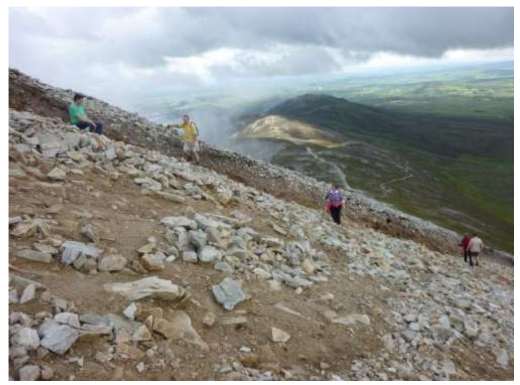
Close up of the actively eroding "edge" of the path up the summit cone – the rate of erosion here appears significant but could be determined by monitoring.