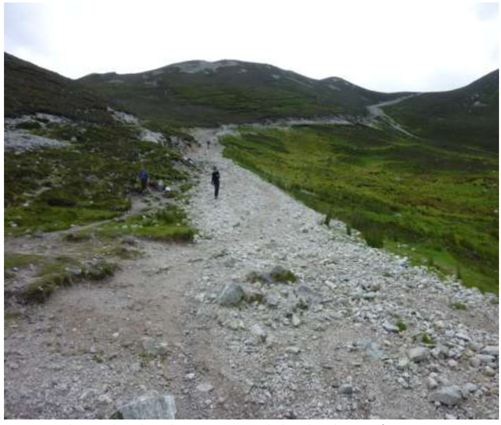
Section 3 Looking southwards up the mountain towards the col – a distance of approx 500 metres.