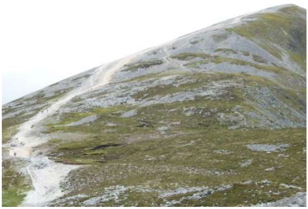
Section 5 The "summit cone" with the line of the path following a steep scree slope – the width of path here is in excess of 30 metres and is clearly and actively "migrating" into the ecologically sensitive and important scree slope to the north (right) of the path.