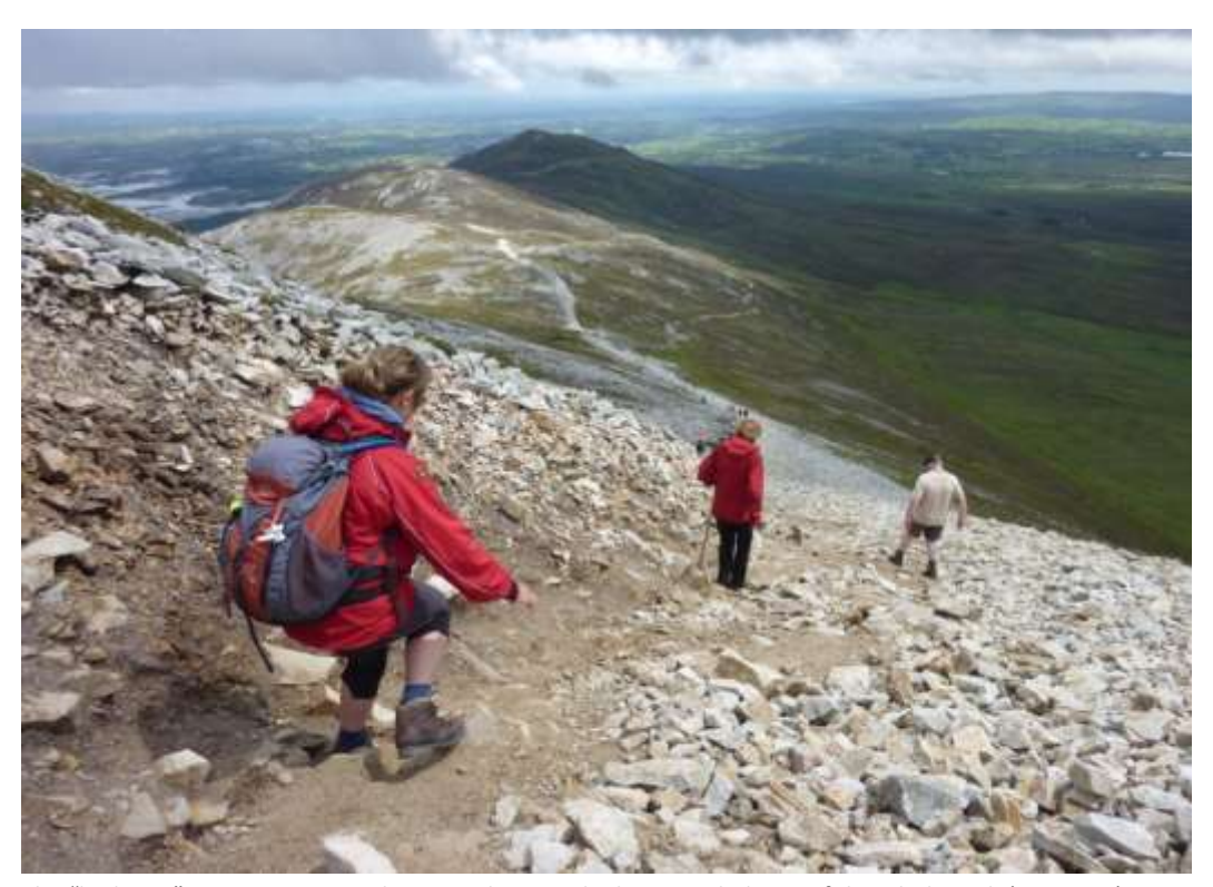
The "bad step" on section 5 – with a view showing the least eroded part of the whole path (Section 4) which is clearly visible leading from the base of the cone to the col.

This is the most level section and the least eroded section of the path, as the path changes direction and heads almost directly west along the col to the base of the cone. There is some erosion and some subsidiary paths have formed but in general the problem is not significant along this section.