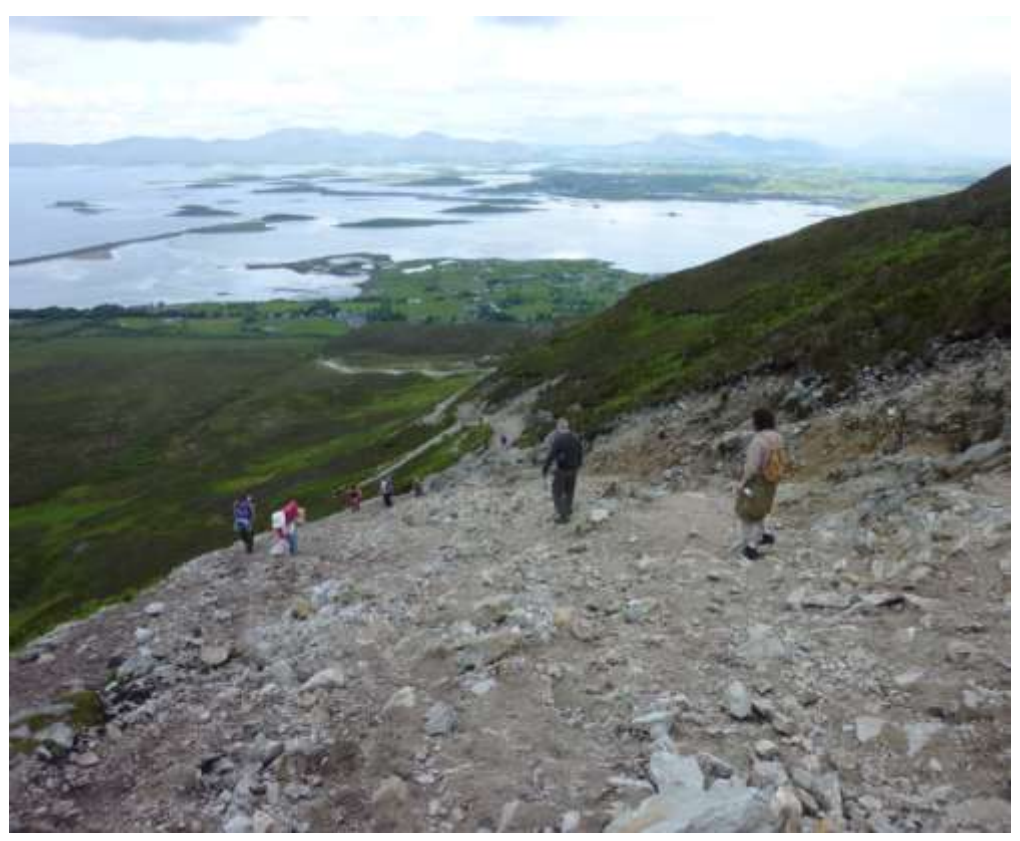
Looking north down the upper part of Section 3 – in the middle distance, the upper part (the least eroded section) of Section 2 is clearly visible.