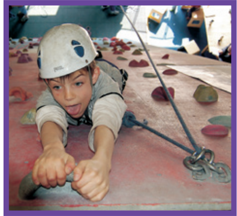
Top roping at in indoor wall

The BMC publishes a climbing wall directory that is free to members, and has a searchable database of walls on the website at bmc.co.uk/map#walls . This will help you locate climbing walls in your area. Notification of forthcoming competitions and other events are also posted on the BMC website under Indoor Climbing and Competitions.