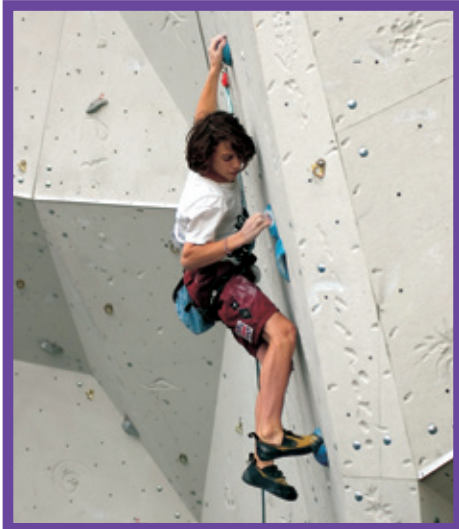
An indoor climbing competition