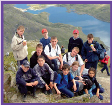
Hill walking has fabulous views